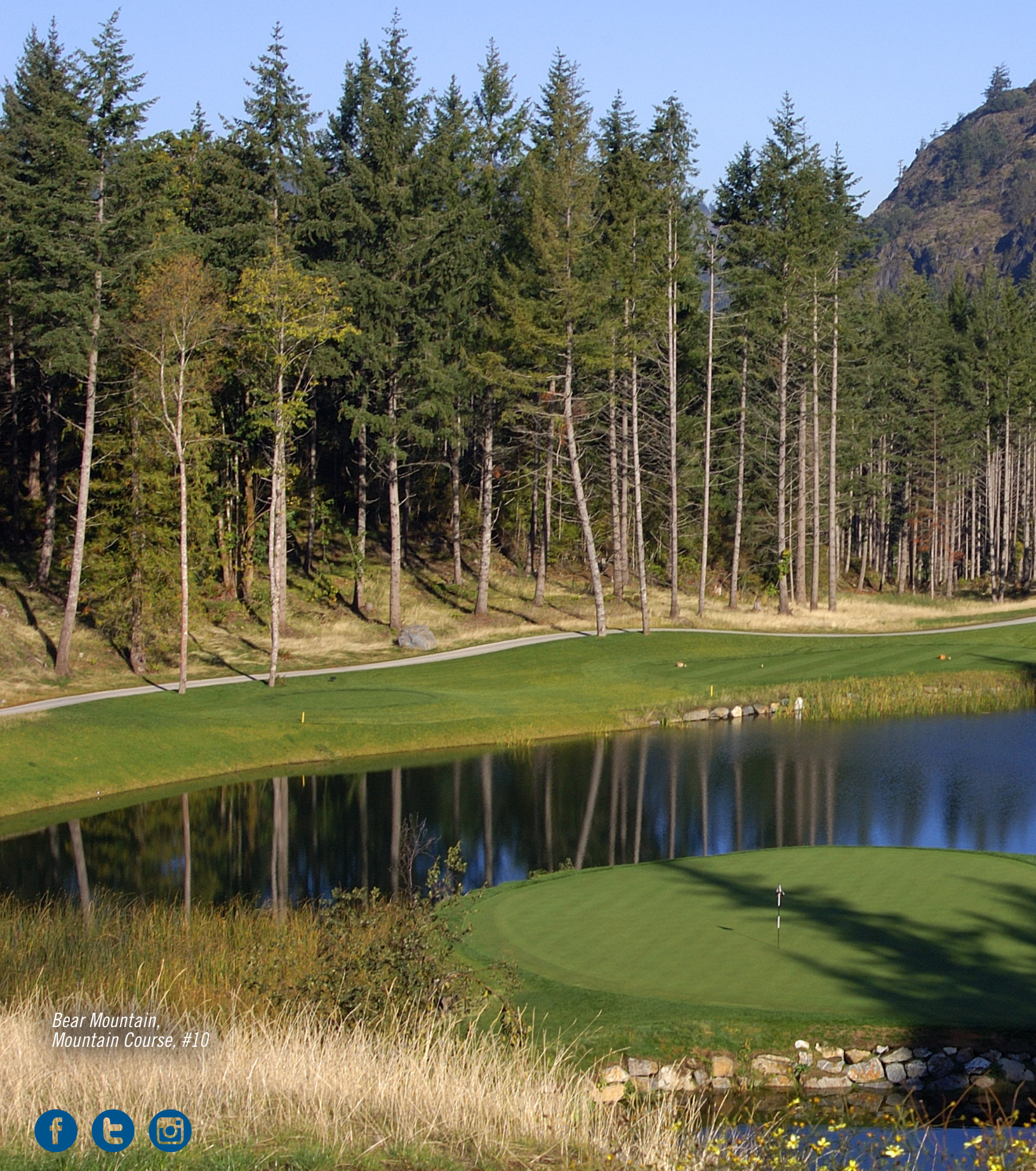
Bear Mountain, Mountain Course, #10