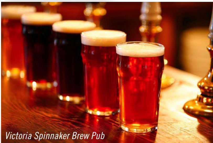
Victoria Spinnaker Brew Pub