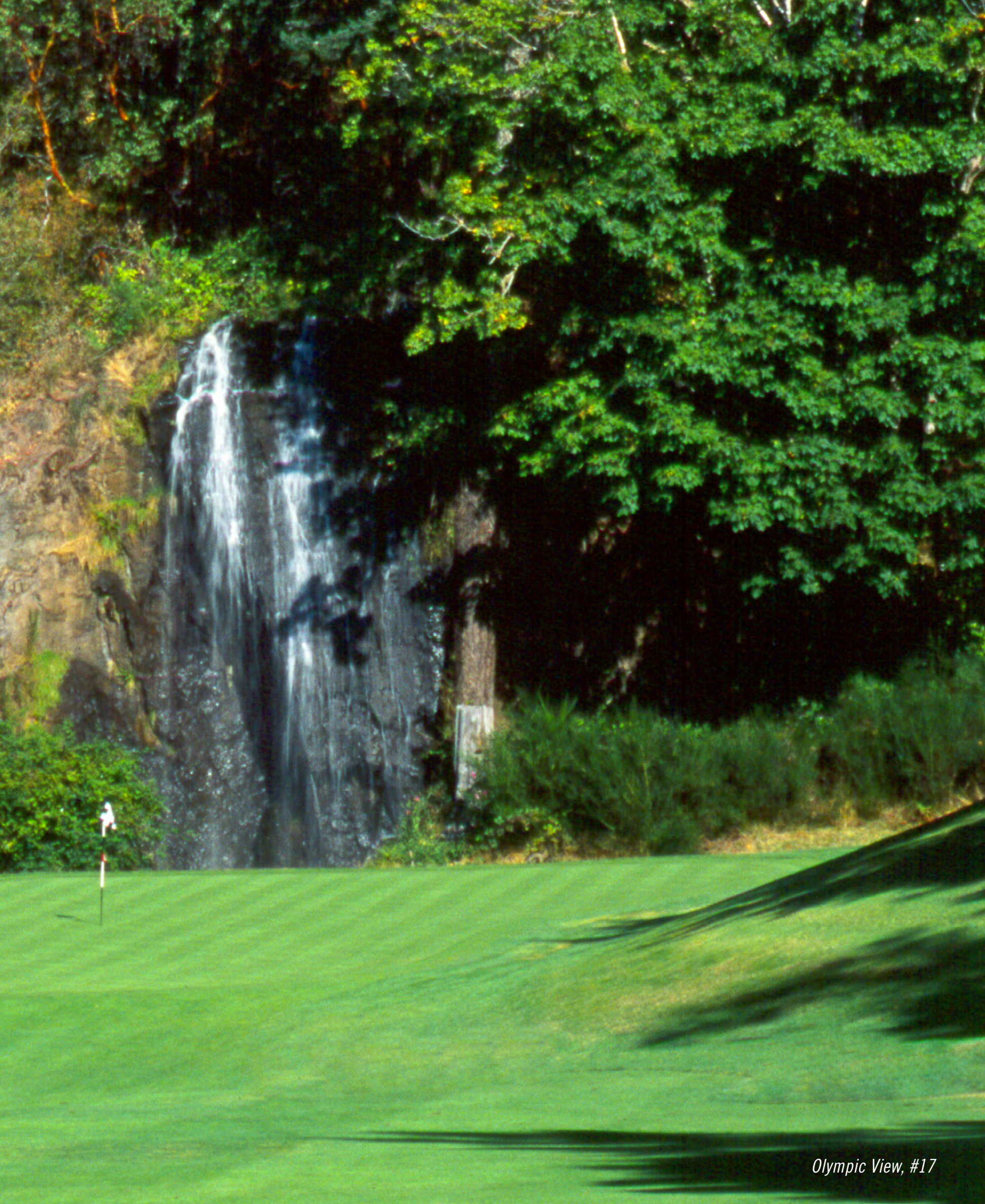
Olympic View, #17