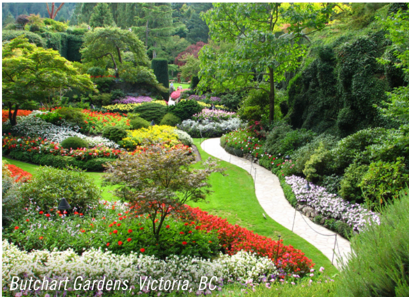
Butchart Gardens, Victoria, BC