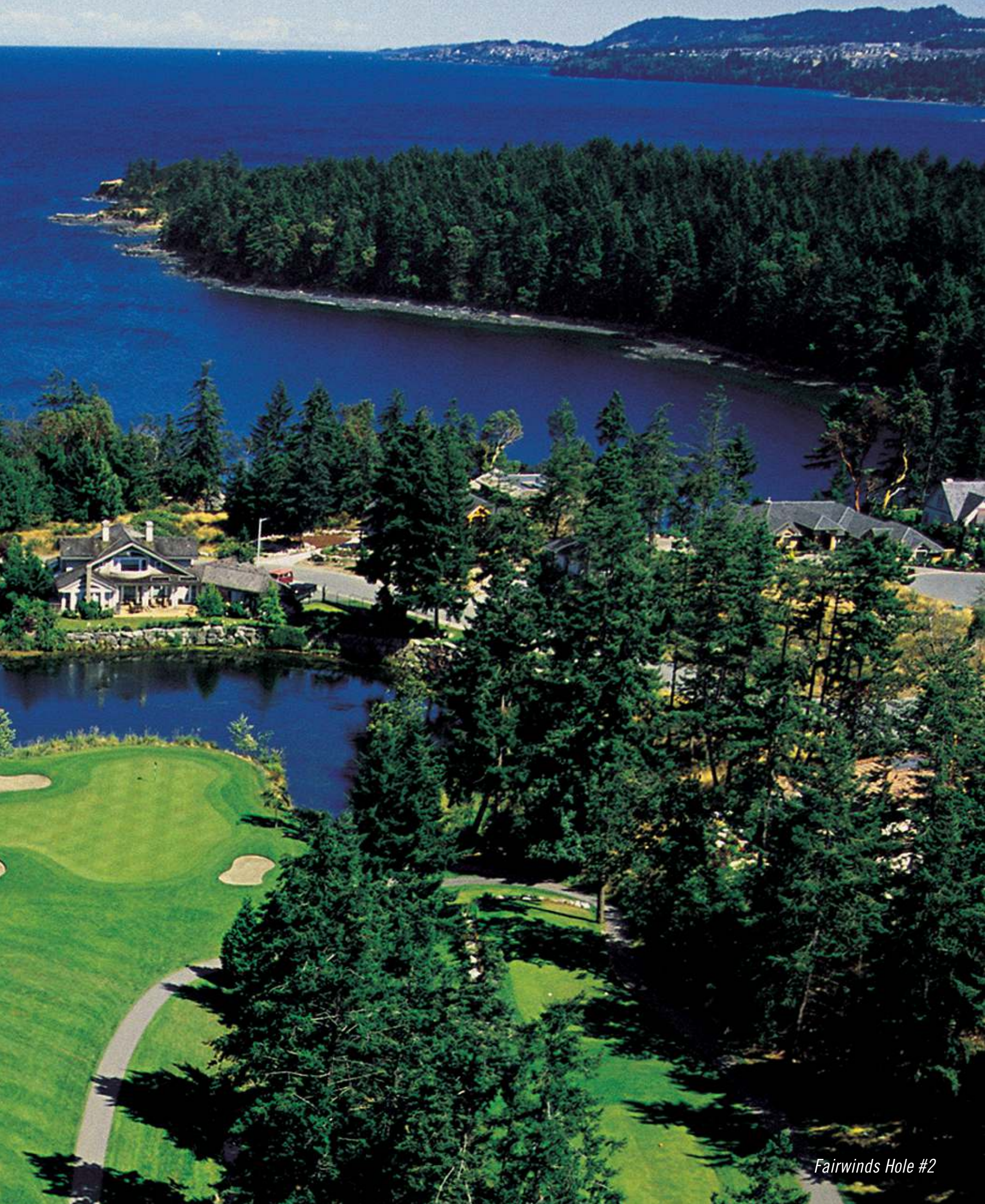
Fairwinds Hole #2