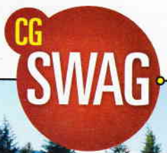
Bear Mountain Resort Mountain No. 11