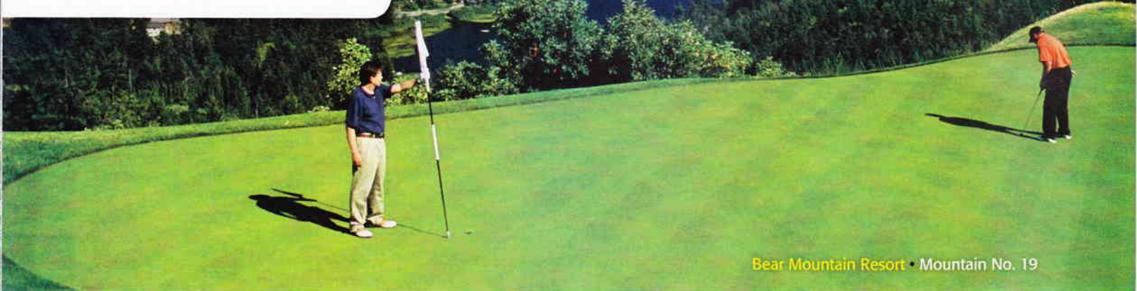
Bear Mountain Resort • Mountain No. 19

B.C.'s Vancouver Island Golf Trail is A MUST-DO