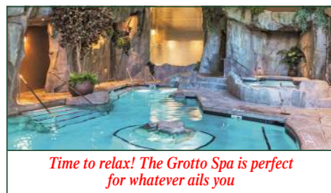
Time to relax! The Grotto Spa is perfect for whatever ails you

America), The Grotto Spa , the resort has 192 rooms ranging from ocean views with balconies to separate cottages, along with newly renovated and upgraded rooms that are more upscale and 'contemporary rustic'.