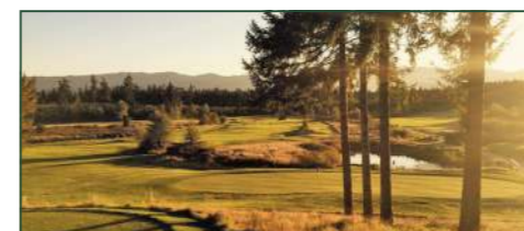
Room to swing at Pheasant Glen but the fescue is no place to hit into

The course has teeth tho, with the fescue and rough thick and the