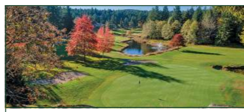
Fairwinds comes complete with trees, rocks and shotmaking challenges

The first hole gives you a great taste of what is to come, a short par 4 where being conservative pays off much more than trying to eke out every yard you can from the tee. There is water on this hole and on many others, but since your focus should be on hitting the fairways it doesn't come into play much.