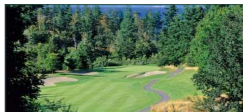
Elevation changes add to the many views at Fairwinds

The par 3s are varied and all have their own challenge, ranging in length from 118 at #6 to a 198 yard beast at #14. This long par 3 has a rock wall up the right and a creek on the left so a par here is major victory.