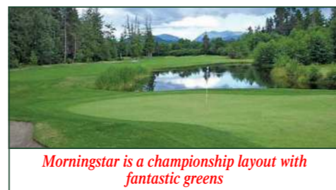
Morningstar is a championship layout with fantastic greens

Day 2 was at Morningstar Golf Club , as championship-type golf course as you want to play. Another Les Furber design, the course offers a mix of links and treed holes, and is set up so that every golfer can enjoy, the length ranges from 5277 yards up to 7,000 and a slope of 141.