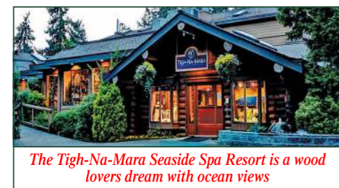
The Tigh-Na-Mara Seaside Spa Resort is a wood lovers dream with ocean views

To make things even easier, you can find out about British Columbia tourism through www.hellobc.com , and if you want all the info on booking your golf getaway just visit www.golfvancouverisland.ca or call 1.888.465.3239