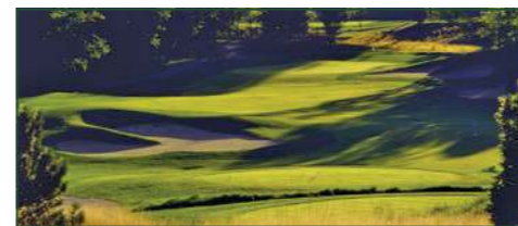
Some of the most dramatic holes on the Island are at Morningstar

hitting greens. You start with a wide fairway on #1 and another on #2, and start to think that the driver is working and you are scoring well so the rest of the round should be no trouble. Then the tight, winding par 5 3rd hole hits you and the card just got a little ugly.