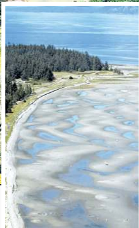
Fairwinds Golf Club in Nanoose Bay offers up superb views of the Salish Sea. Inset: The beach at Rath Trevor Beach Provincial Park could be classified as the world's largest sand-trap.

Tigh-Na-Mara — the 22-acre spread features rustic log accommodations and their Grotto Spa has been crowned as Canada's best two years running by Spas of America — and the calm waters of the Salish Sea with a pitching wedge. At low tide, though, it would probably be a Par-7, with a full kilometre of sand between your toes before your feet get wet.