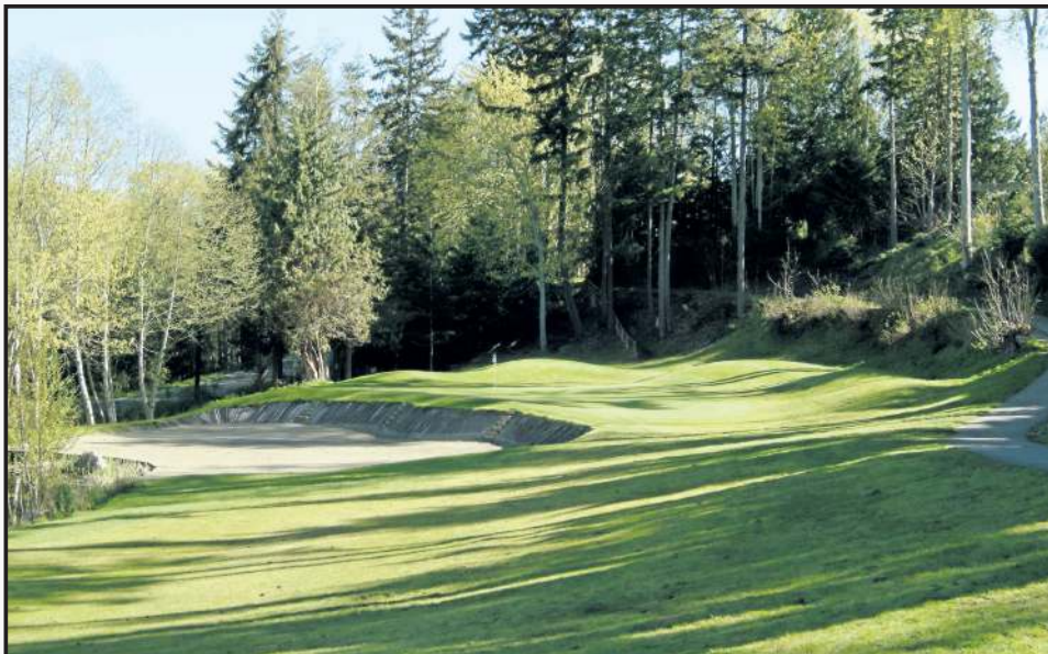
Morningstar Golf Club in Parksville has a history as a proving ground for the next wave of wannabe stars, a frequent site of the spring qualifying school for the Canadian Tour.